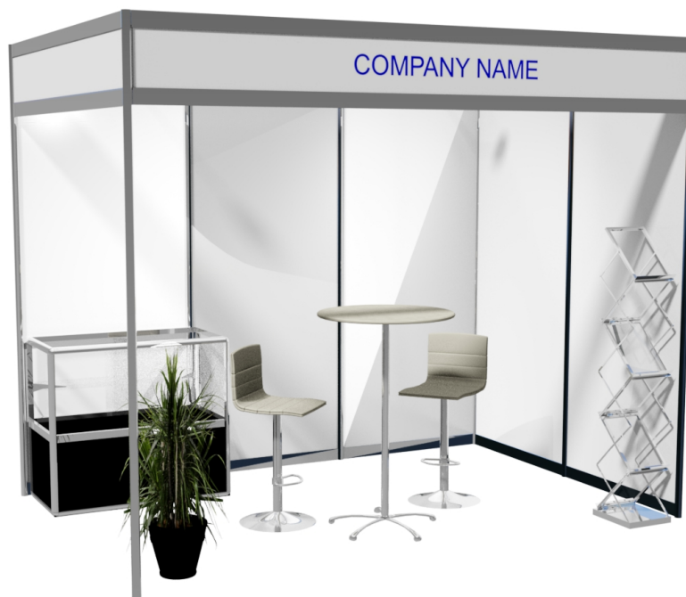
Furniture Sample for this size booth.

Company Name is part of your package please fill in page 3.